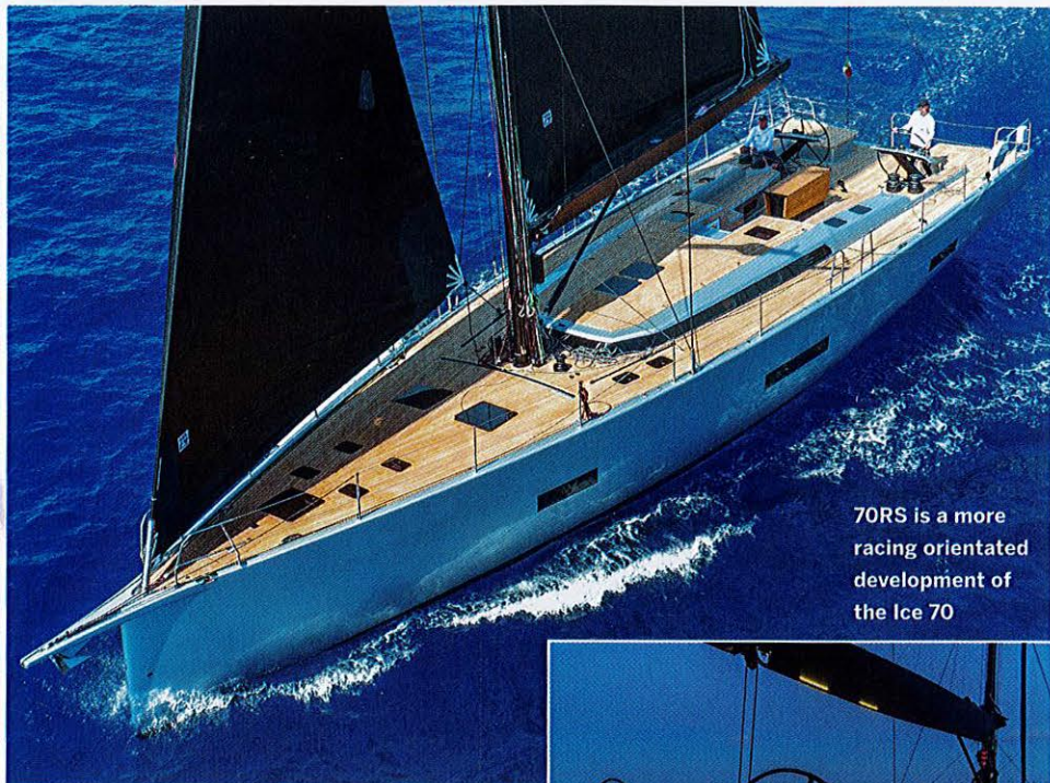
70RS is a more racing orientated development of the Ice 70