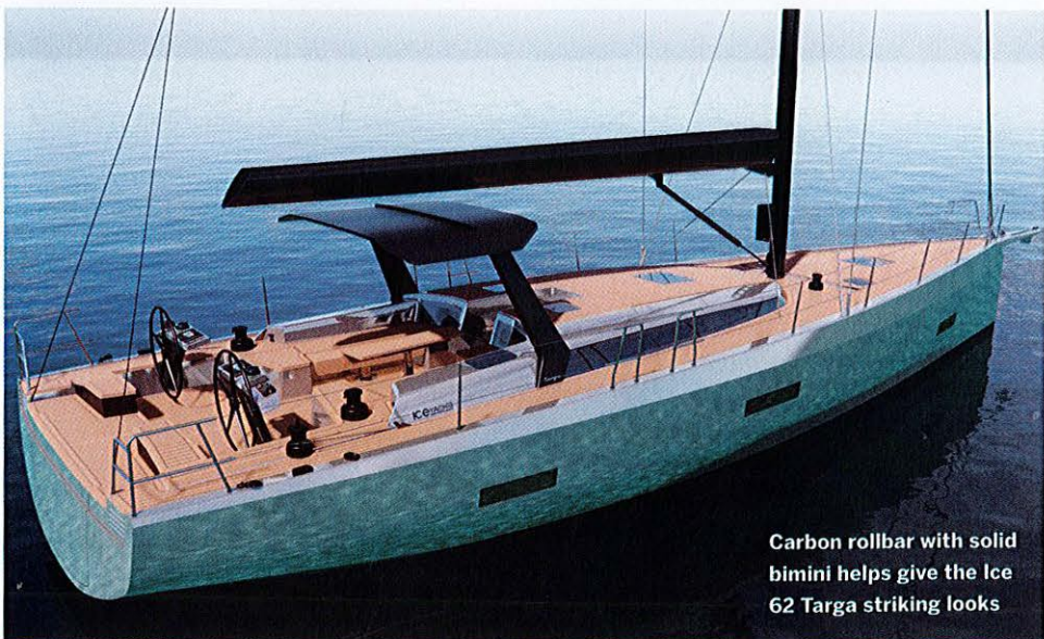
Carbon rollbar with solid bimini helps give the Ice 62 Targa striking looks

Hull and deck are built with infused carbon fibre, while a hydraulic lifting T-keel with increased bulb weight reduces draught from 4.4m to 2.8m. iceyachts.it